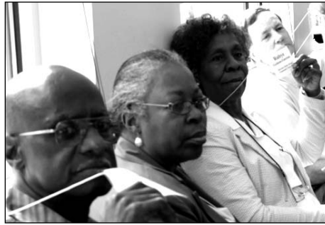
CFC delegates approve legislative recommendations

Enact the recommendations of the Arkansas Governor’s Global Warming Commission. Most experts agree that there is a critical deadline to curb greenhouse gas emissions before facing dire consequences. They also say there is an enormous opportunity for economic growth as the rush to create greener energy