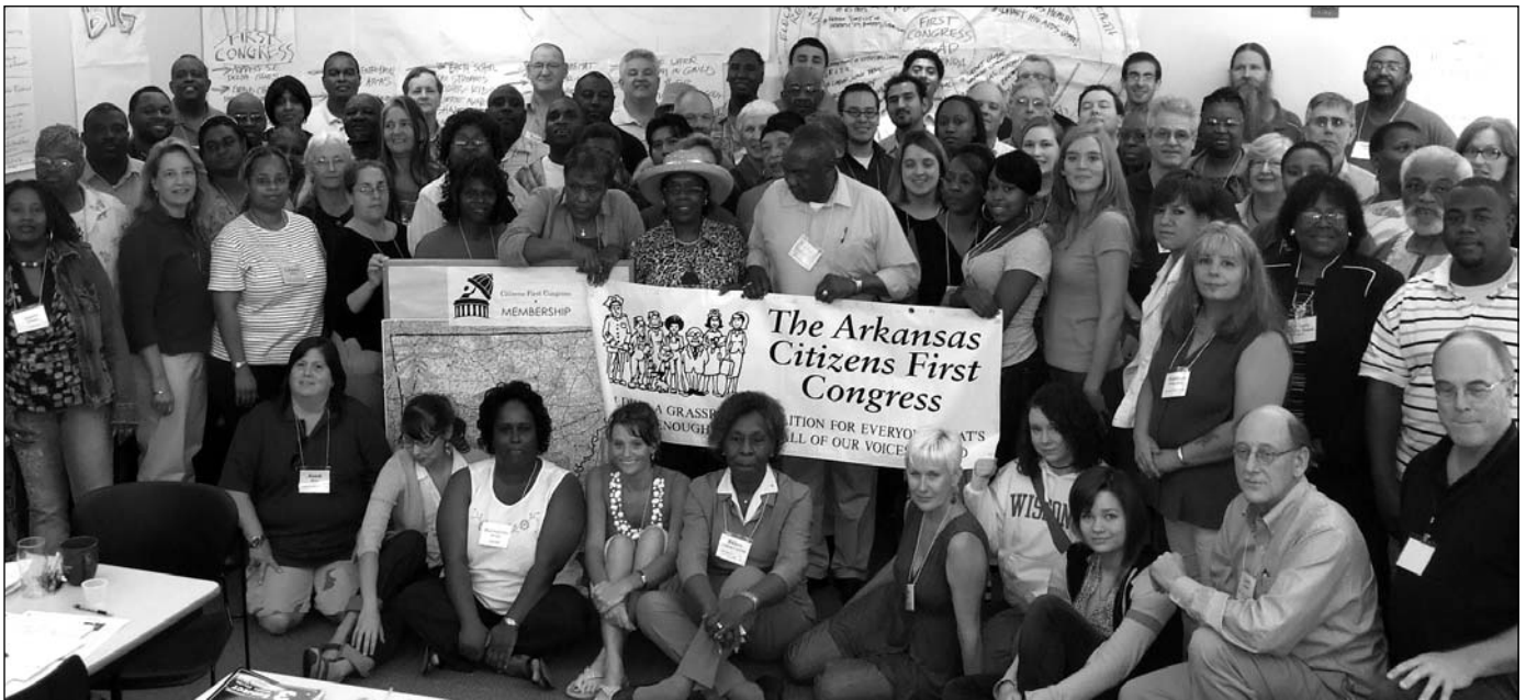
Members of Arkansas' Citizens First Congress celebrate completion of the group's 2009 legislative agenda.