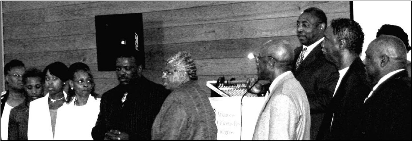
The Gould Citizens Advisory Council accepts the Dragon Slayer award at the Panel and Congress' anniversary banquet.

Two hundred supporters gathered on August 16th to celebrate the 10th anniversary of the Citizens First Congress and the 45th anniversary of the Arkansas Public Policy Panel.