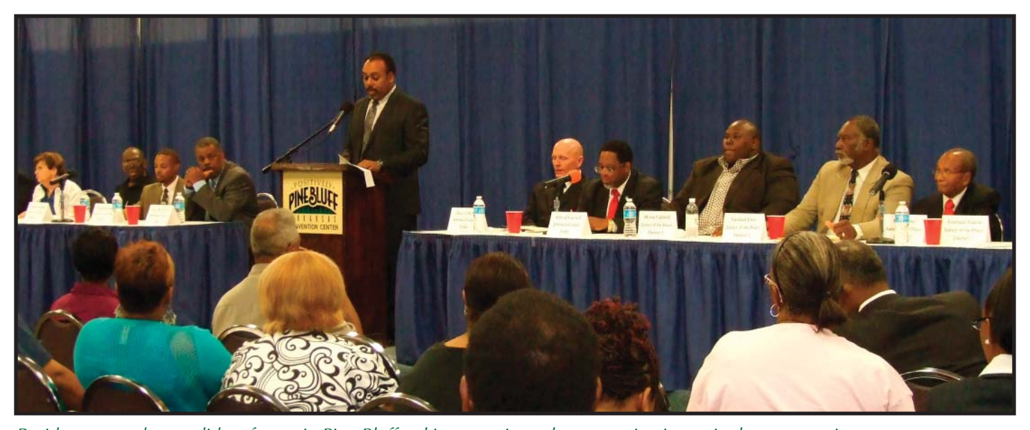
Residents attend a candidate forum in Pine Bluff, asking questions about pressing issues in the community.

The stakes of the 2014 elections are high, and South Arkansas residents are preparing to make their voice heard. Building on unprecedented successes holding candidates accountable in the 2012 elections, leaders are focusing on local and state level races coming next year.