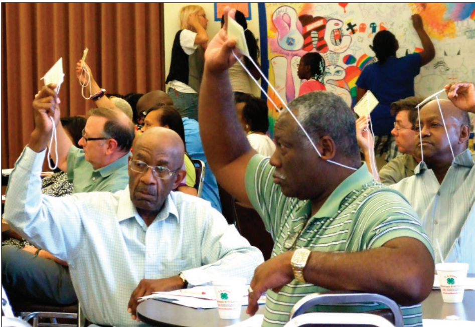
Members of the Gould Citizens Advisory Council voting at the Citizens First Congress Convention. Based on the work they are doing to make local elections more fair, GCAC introduced the election reform proposal that is now one of the CFC's Ten Priorities for a Better Arkansas.