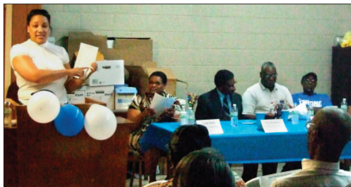
Candidates for school board answer questions from parents at a forum hosted by the Strong Community Leadership Alliance.