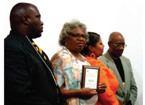
The Gould Tax Relief Fund received the Southeast Arkansas Activist of the Year award for their work to pay the city's back taxes in the face of City Council inaction.