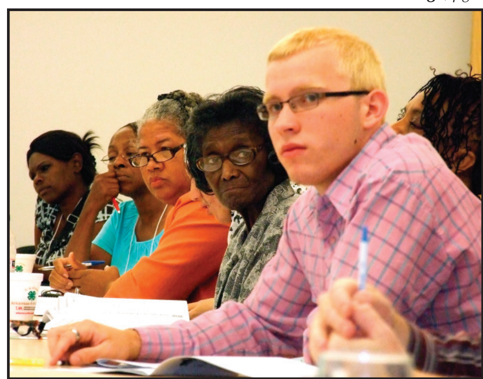
Delegates to the Citizens First Congress Convention hear testimony from fellow delegates before they vote on their new platform for the Arkansas legislature.