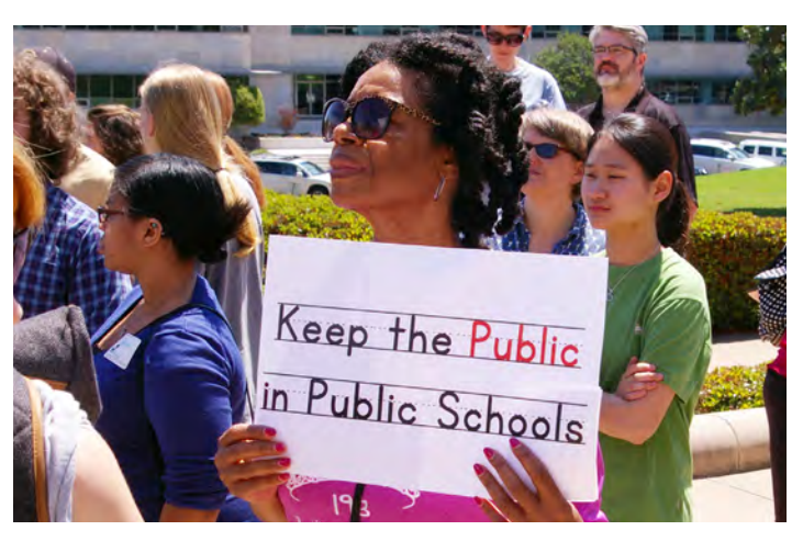
Hundreds of parents, lawmakers, educators and community members stood together on the Capitol steps to support the students of the Little Rock School District and public education statewide. The Panel helped organize the rally.

We stand united for high quality PUBLIC EDUCATION because the overwhelming consensus among education researchers is that it makes our children and communities stronger. Strategies such as increased parental involvement, improving discipline policies, quality pre-K, quality afterschool and summer programs, community schools, and services that counter or reduce poverty have much more evidence and promise than privatization and charter schools. This is uniting different parts of the city and we are working in coalition with many partners to engage more students and parents focused on improving education for all students.