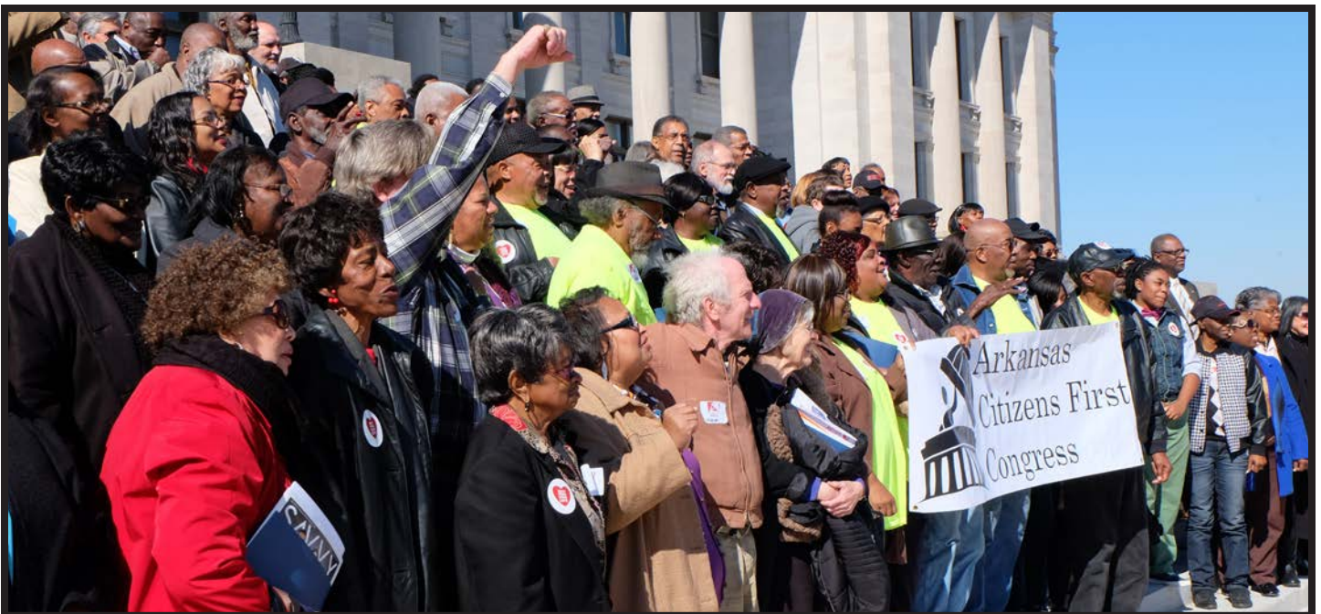
Members of the Arkansas Citizens First Congress rally on the Capitol steps to tell legislators to put Arkansas families first.

A rkansas just finished our first session under Republican control of the legislature and the executive branch.