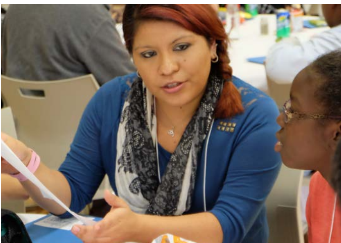
Over 200 Arkansans at the 2014 Arkansas Opportunity to Learn Summit shared their perspectives, and voiced concerns in issue-based workshops.

Parents, students and teachers from all over the state met with education experts in October to develop those strategies for cont. →