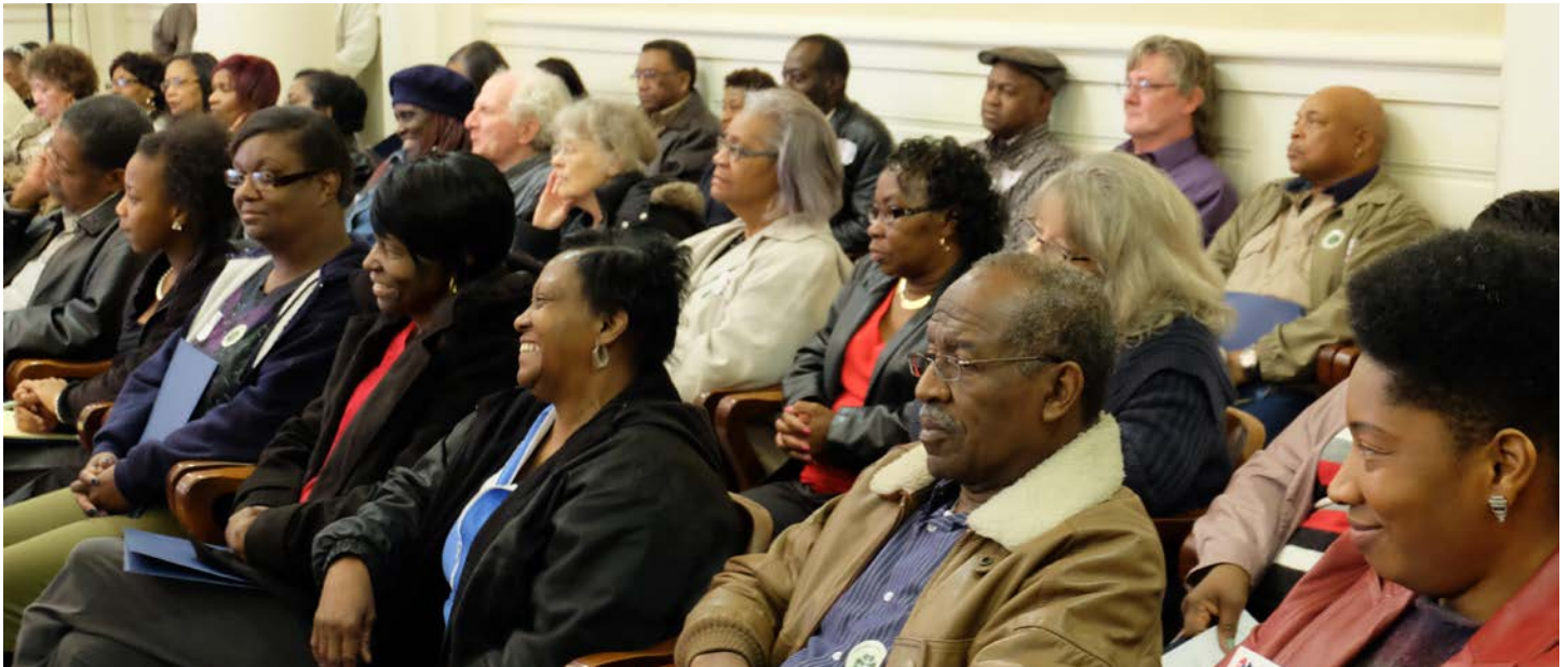
CFC members packed the Old Supreme Courtroom in March for an update on legislation filed to improve Arkansas' education system.

ary to highlight the needs of hard working families. The CFC's South Arkansas Caucus led the call to expand pre-K funding, support after-school and summer programs, enact prison reform, improve the election process and create a state level Earned Income Tax Credit to lift the working poor from poverty.