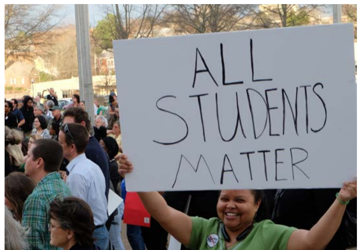
Hundreds gathered at the Capitol to oppose school privatization.