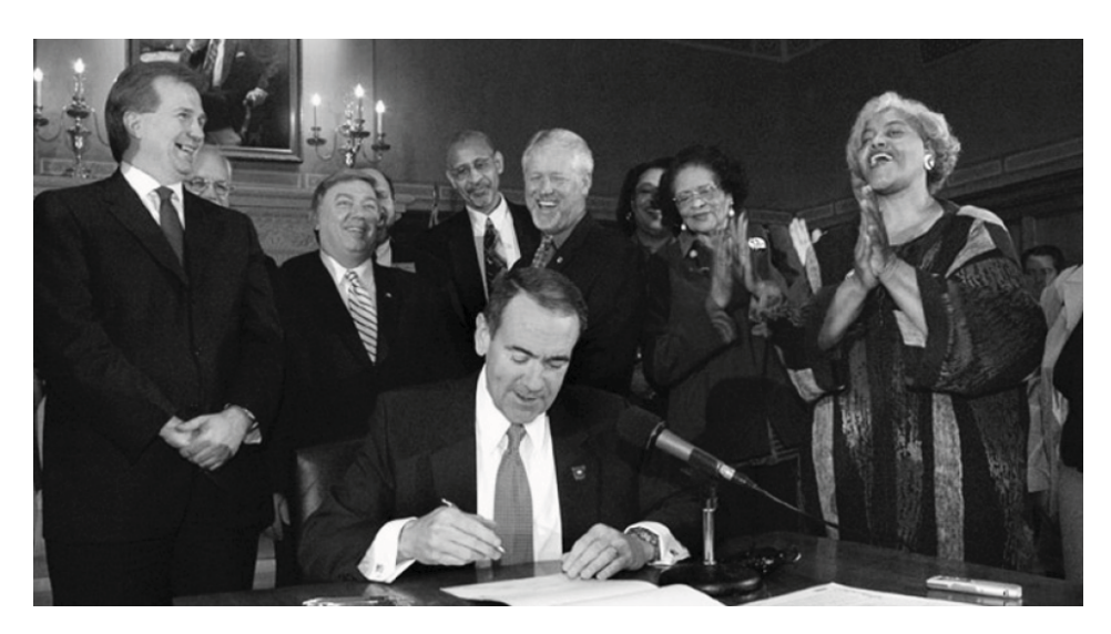
Republican Governor Mike Huckabee signing the bill to increase Arkansas's minimum wage in 2006, before the federal minimum wage increase.

Because of the gains by conservatives in the state's electoral environment since 2008, now is a crucial time that will shape the state's politics for the next generation.