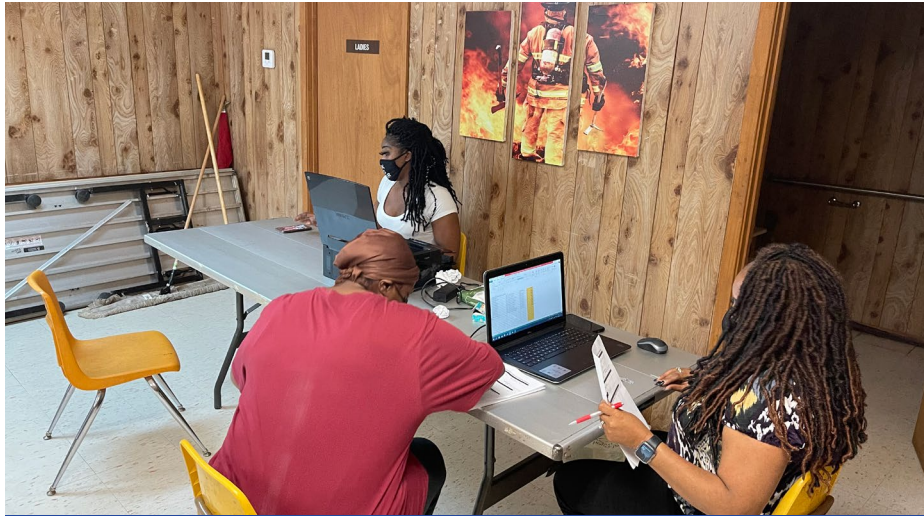
Leaders helped residents in Gould and Grady apply for COVID-19 relief at Gould First Baptist M.B. Church.

Since December, leaders in South Arkansas have been masking up to host a series of assistance drives focused on helping those behind on utility bills.