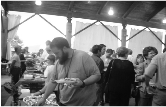
Arkansas Farm Community Alliance celebrating their big win to create an Arkansas Department of Agriculture at 2005 Legislature with a big feed!

Non-Profit Org. US Postage Paid Little Rock, AR Permit 756