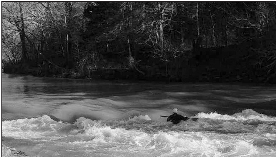
Lee Creek, Arkansas

A single special interest group is now endangering all of the scenic waterways in Arkansas for the sake of their own pet project. Unless the public acts soon, we may miss the chance to help save Arkansas' most important waterways.