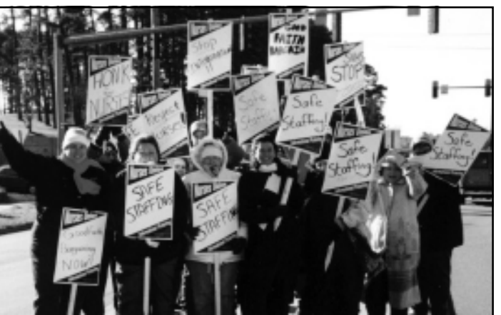
St. Vincents Nurses out in the cold fighting for a fair contract