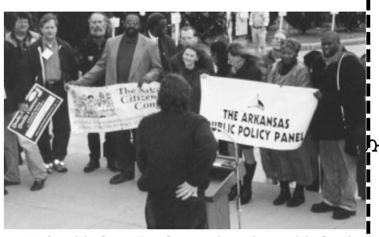
Members of the Citizens First Congress gather on the steps of the Capitol

Thanks to all those who contributed and participated!