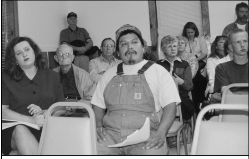
Members of WCSSE discuss safety at the explosives storage facility with officials