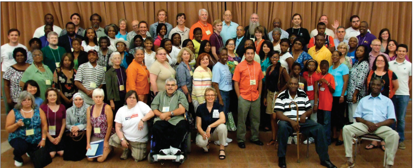
Delegates and observers representing the 45 member groups of the Arkansas Citizen First Congress pause for a photo before voting for the coalition's 2010 policy platform.