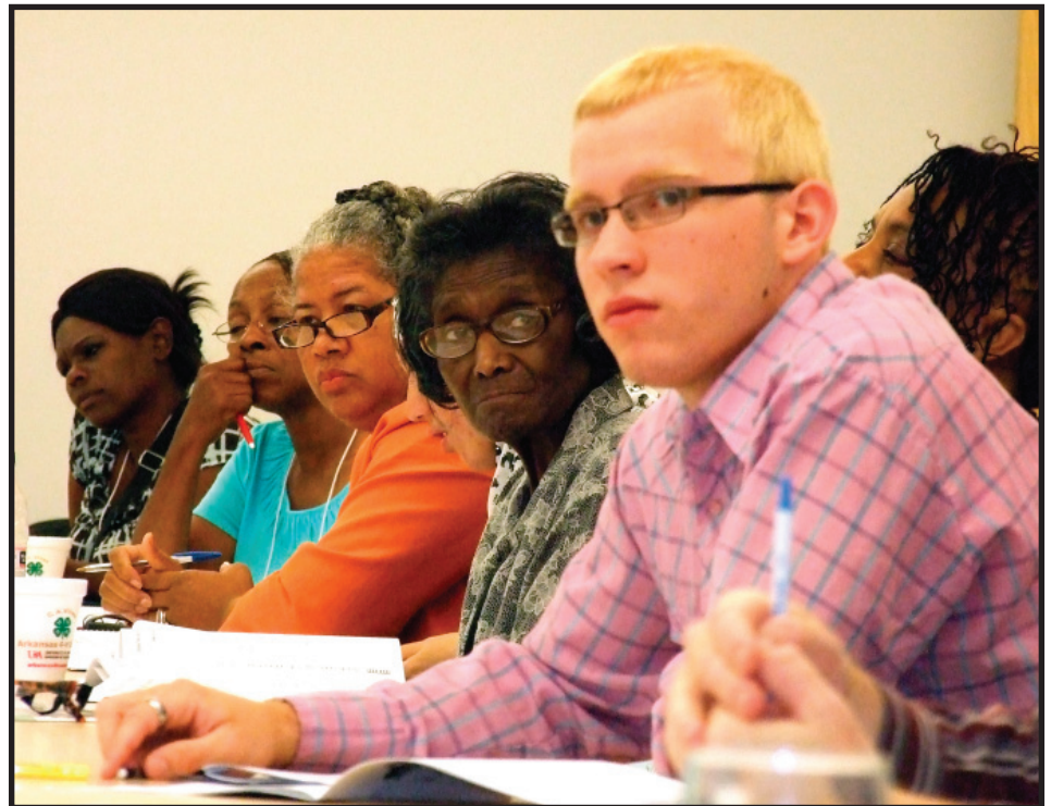
Delegates to the Citizens First Congress Convention hear testimony from fellow delegates before they vote on their new platform for the Arkansas legislature.