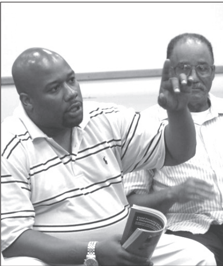
A Dumas small business owner at a town hall meeting of the Legislative Task Force on Reducing Poverty and Promoting Economic Opportunity.