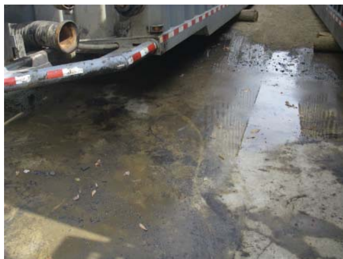
Oily waste under a frac tank from a spill or leak.

This report adds evidence that Arkansas needs stronger protections for clean water, more manpower and more resources to adequately inspect the current natural gas drilling operations throughout the Fayetteville Shale Play. Further, the Arkansas Department of Environmental Quality needs a stronger commitment to robust inspection and enforcement to protect the state's water resources.