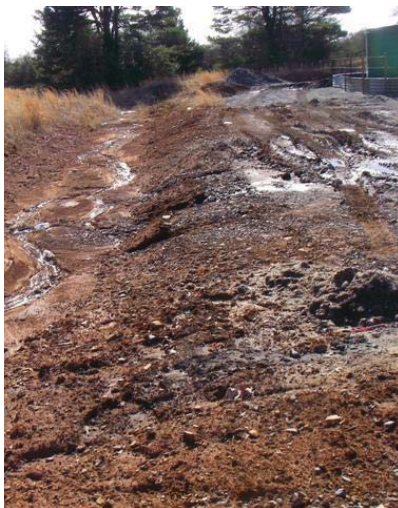
Sediment erosion from west edge of the pad.