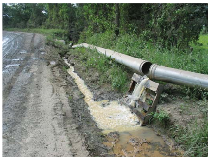
A pipe running from a well pad discharges fluid into a drainage ditch.