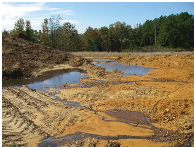
Drilling fluids running off of a well pad.