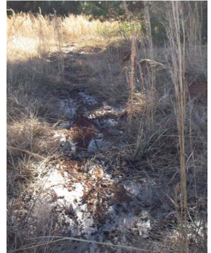
Evidence of sediment runoff west of pad continues into grassy field.