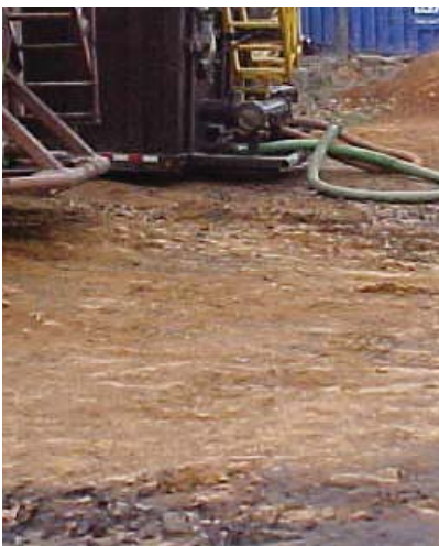
Drilling fluids leaked or spilled on the ground.