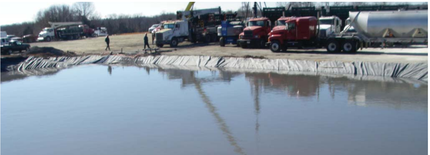
Correctly lined reserve pit with over 2 feet of freeboard.