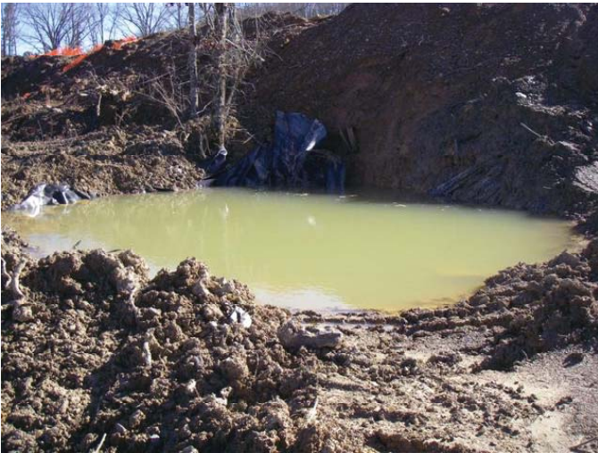
Leaking reserve pit with improper lining.