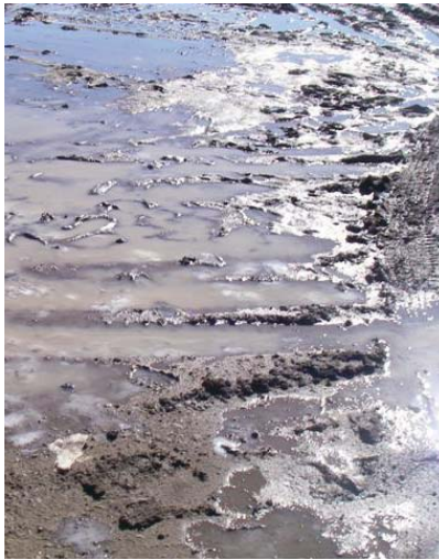
Spill observed on pad.