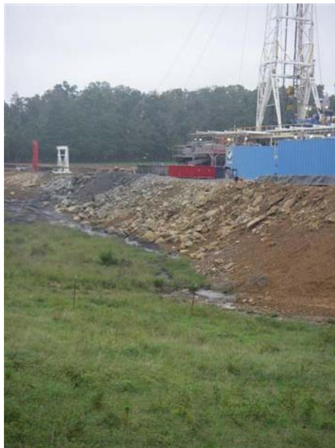
Oil field waste discharging from a drilling pad into a tributary of aptly named Bad Luck Creek.

All complaint, inspection and enforcement files for gas operations within the Fayetteville Shale from 2006 through 2010 were requested from ADEQ. A few of the files received were from outside the Fayetteville Shale area. Each of the 538 files were recorded in a database and analyzed as a whole to create the following report, which provides an assessment of violations and agency response over the past four years. The report shows that the natural gas industry is not operating as responsibly as it claims.