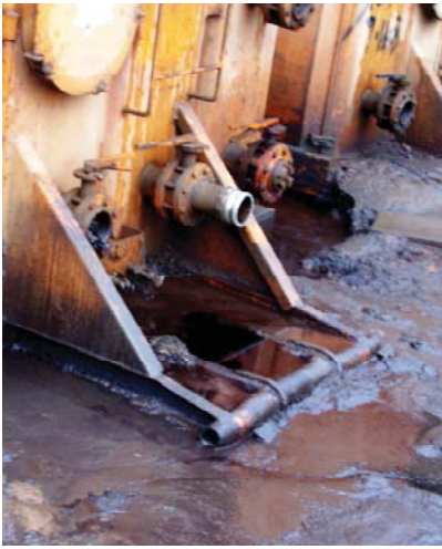
Drilling mud leaking from tanks at a land farm that has since been shut down.