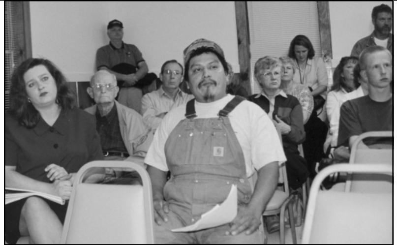
Members of WCSSE discuss safety at the explosives storage facility with officials